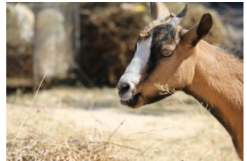
Goat in Mudzi District

Livestock such as cattle, goats, chickens, ducks and guinea fowl are incredibly valuable resources for communal farmers. Yet these resources suffer the impacts of climate change most acutely. Thanks to the education, training, and support that you enable through your support, local farmers are taught risk reduction techniques and financial literacy.