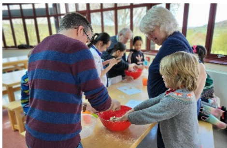
Bread making - apparently